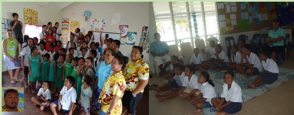
Omoka and Tetautua students after presentations by the team on CRPD, Gender, Youth, Child & Family and Dangerous Goods