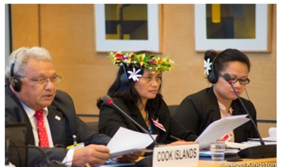
Government Delegation reporting to the UNCRPD Committee in Geneva, Switzerland.

of human rights of persons with disabilities. This included encouragement to review existing laws and regulations, policies, programs and services to ensure that they are not discriminatory and are disability inclusive. The Cook Islands is expected to submit next report to the Committee no later than June 2019.