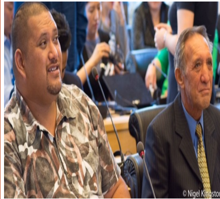
Representatives of the Cook Islands National Disability Council

The Cook Islands National Disability Council was also part of the delegation to report to the UNCRPD Committee in Geneva, Switzerland in April this year.