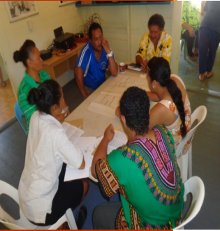
During a group discussion during the CRPD training in Mangaia

“The articles of the Convention was well articulated during the training and translating it into the Mangaian language made it simple for us to understand”