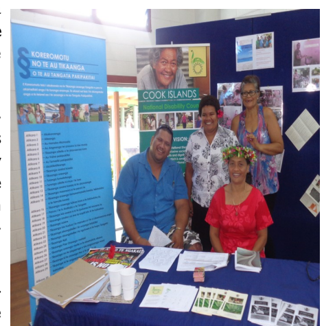
Disability Division staff & members of the CINDC during the Social Development session.

The meeting was held from the 9th-13th of February this year.