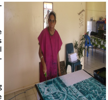
Reuela at screen printing pareu

Plans are also underway to include young women with disabilities in these Tivaevae teaching sessions in the future.