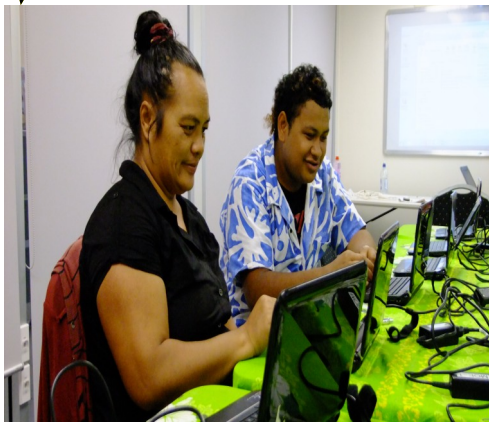
Teacher Aide working with IT unit.